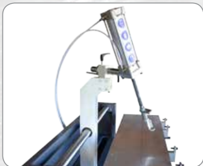
Piston Movement: 200 mm

The most universal work station with easy access to all faces of the cylinder head. For disassembling and assembling of valves springs on cylinder heads for cars, trucks and motorcycles. Valve compressor lock for easy retainer removed "hand free". Access for camshaft setting and all other cylinder head operations.