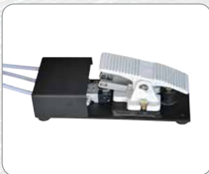
A Double Action Pedal