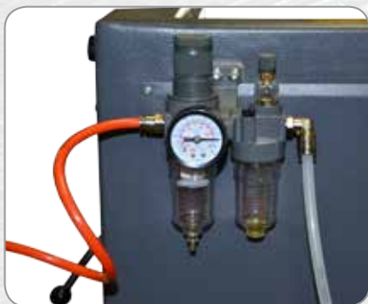
Air Pressure Required : 6 – 10 bar