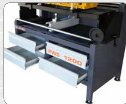
4 Drawers for tools