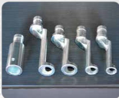
5 Sizes Pressure Foot – Standard Equipment